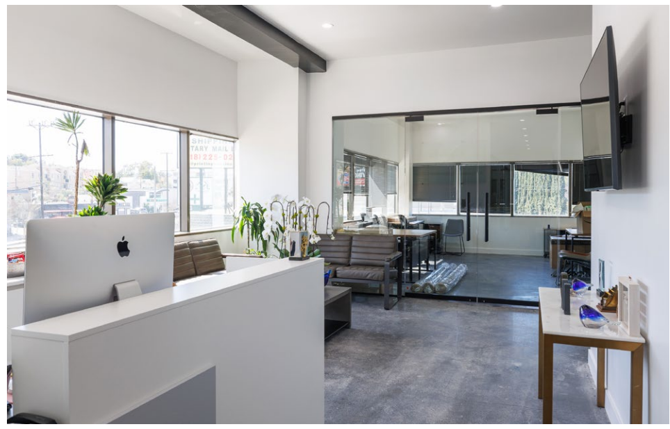
Lee & Associates® - LA North/Ventura, Inc.